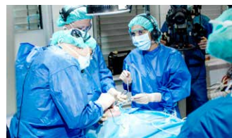
Mentoring and patient treatment