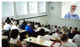
On-site course formats